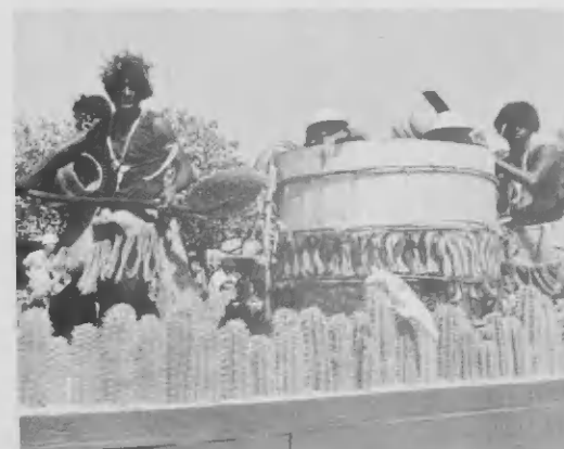
Cannibal Beach Party